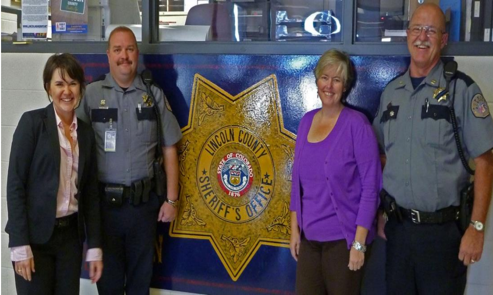
JDI Staff with partners at Lincoln County Jail, Colorado