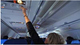
Families flying coach won't get preferred United boarding