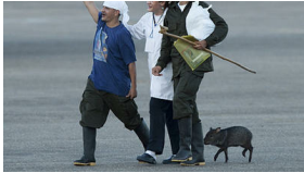
Colombia rebels' hostage recalls friendship with pig