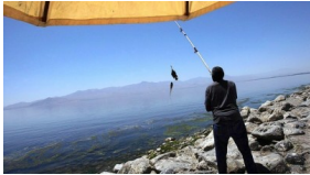
Salton Sea may close due to budget crisis