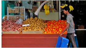
A taste of India's street food

Terms of Service | Privacy Policy | Los Angeles Times, 202 West 1st Street, Los Angeles, California, 90012 | Copyright 2012