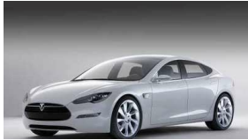
Tesla to deliver Model S electric cars next month