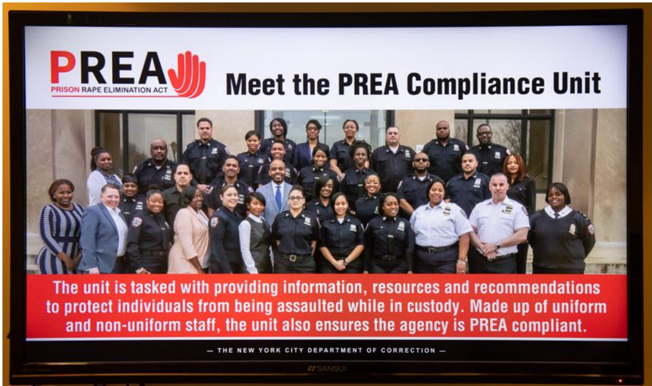
The NYC Department of Correction PREA team

Allegations of sexual abuse at the facility dropped more than 40% between the last six months of 2018 and the first six months of this year, Correction Department data says. There was a 24% decrease in accusations across all jails during the same period.