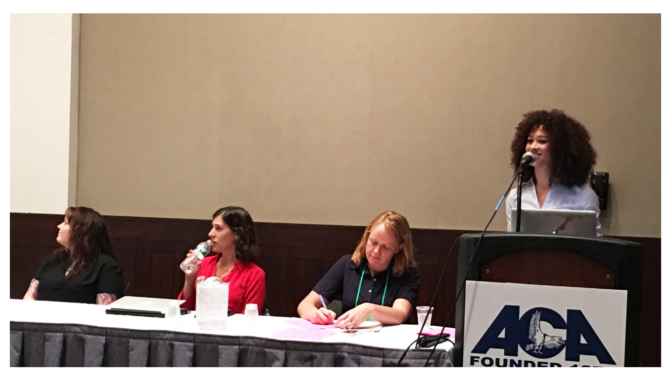
The 2016 American Correctional Association Congress of Correction in Boston, Massachusetts, included this workshop titled "Understanding and Protecting Transgender Inmates, Residents, and Detainees."