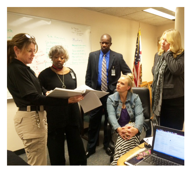
A field training audit takes place at the Sacramento County Sheriff's Department Office in, Sacramento, California.

After creating and implementing the core elements of the PREA Audit Function, including the audit instruments and auditor certification process, the PRC and PMO turned attention over the past year to developing a PREA Audit QO program. The primary objectives of the QO program are to collect information about audit activity and use that information to inform ongoing training for facilities and auditors, support auditors' efforts to meet DOJ's expectations for PREA audit reporting and audit process, and improve the PREA audit's overall quality and rigor.