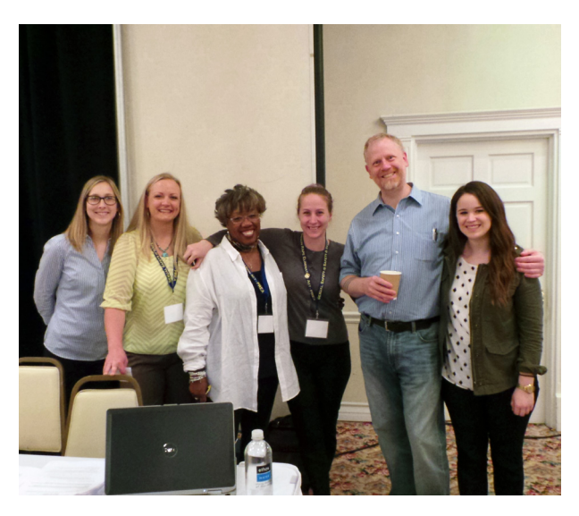
Auditor training faculty in San Diego, California.

The corrections field and affiliated organizations have actively reached out to PRC for assistance, as demonstrated by the more than 801,188 website visitors since the website's launch. Since the release of the PREA standards, TTA efforts have included responses to more than 4,000 field-initiated requests and "Contact Us" inquiries from the field.