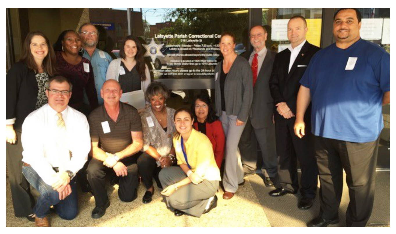
The field training audit team at the Lafayette Parish Correctional Center in Lafayette, Louisiana.

conducted in unreasonably short periods of time, audit reports that are issued without any corrective action, and audit reports that indicate the auditor did not conduct a requisite number of interviews of staff and/or inmates to render reliable results. As needed, PRC staff reach out to auditors to talk with them about challenges that have been identified and to work closely with auditors to improve auditor behavior and/or the thoroughness of audit reports. PRC staff also provide individualized written feedback to auditors outlining how to improve their work and pointing them to available resources for support. To date, PRC has conducted over 50 quality improvement reviews of completed audit reports.