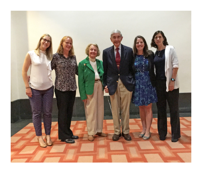
John A. Kaneb, former PREA commissioner, with PMO and PRC staff at the 2016 American Correctional Association Congress of Correction in Boston, Massachusetts.

The activities of PRC, the PMO, and their partners to lead nationwide implementation of the PREA standards are comprehensive and broad in scope. They also are, when necessary, tailored to meet a jurisdiction's specifically defined needs. Since the release of the standards, PRC, with support from the PMO, has hosted 73 webinars and 26 regional training events with participants from all 50 states, the District of Columbia, and Canada.