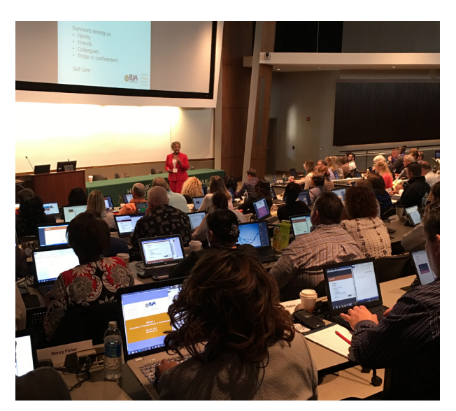
Auditor training in Harrisburg, Pennsylvania.

With support from the PMO, PRC released the Agency Audit when the OAS was made available to the field. Available within the OAS, the Agency Audit is an audit of a limited number of standards that regulate conduct primarily or solely at the agency or central office level. The Agency Audit results will be valid for one year, and it relieves facility auditors from the responsibility of auditing the same agency-level operations repeatedly during each facility audit in agencies with multiple facilities. The electronic nature of the Agency Audit allows for the seamless sharing of specific information across audits within an agency and creates tremendous efficiencies for auditors and agency- and facility-based staff responsible for preparing for audits.