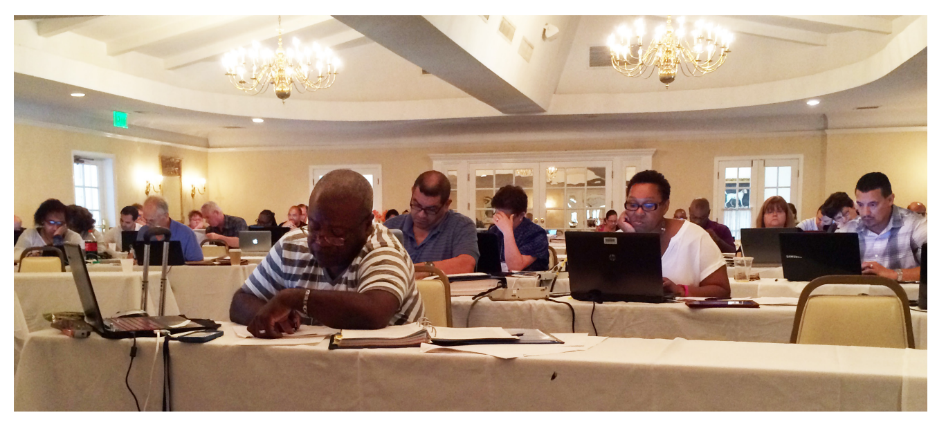
An auditor trainee certification exam takes place in San Diego, California.

The second request came from the Community Corrections Unit of the Ohio Department of Rehabilitation and Correction (ODRC). Recent PREA audits identified several areas of noncompliance in ODRC's community corrections facilities. One area identified for improvement was the execution of their administrative investigations of PREA incidents. The field-initiated TA established criteria to select the appropriate staff to perform the administrative investigations and delivery of a TFT for participants who would then deliver the training going forward to ensure quality of conduct regarding PREA incident investigations, as required by the standards.