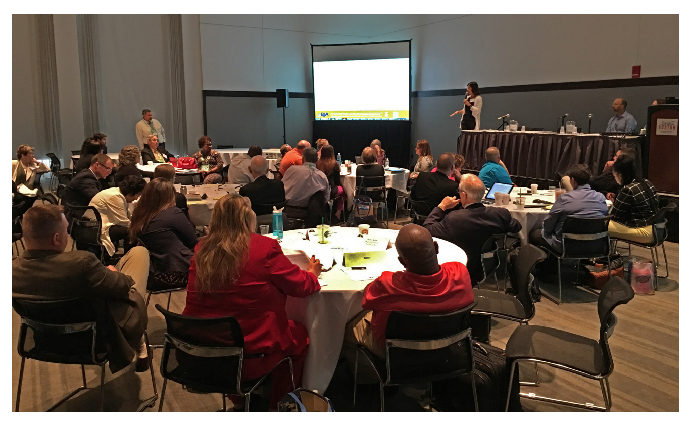
The 2016 American Correctional Association Congress of Correction included this PREA auditor refresher training.

In addition to supporting auditors in the field, PRC notifies auditors of critical information as it pertains to the audit process through auditoronly newsletters. Over the past year, PRC sent six such newsletters. PRC also disseminates requests for proposals and other solicitations for audit contracts received by PRC from external entities. These are posted to the Auditor Continuing Education and Resource Portal (see below) as they are received.