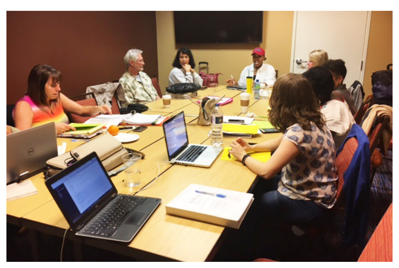
A field training audit group discussion takes place at the Travis County Correctional Complex in Del Valle, Texas.

NCCD is honored to have been afforded the opportunity to lead and operate the PRC since its inception. The elimination of sexual violence from this nation's confinement facilities is a critically important human rights goal. Much has been achieved by the PRC to date to address the scourge of sexual violence in confinement facilities; much work remains to fulfill the great promise of the PREA statute and standards.