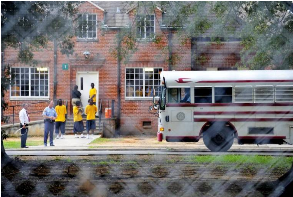
The federal Department of Justice National Survey of Youth In Custody found the all-female Macon Youth Detention Center detainees reported the fourth-highest rate of "coerced sexual activity."