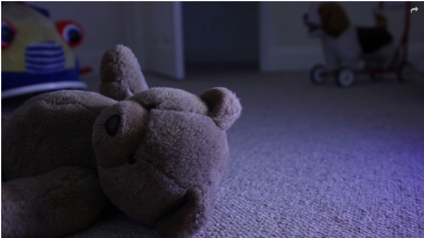
One in four girls and one in six boys will be sexually abused before they turn 18 years old, according to the National Sexual Violence Resource Center. BY ALYSSA HODENFIELD ✉