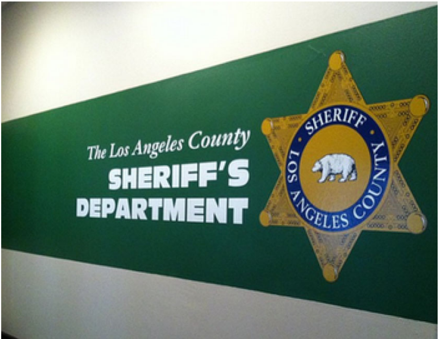
Two Los Angeles County sheriff's captains are accused in separate cases.

By ALENE TCHE By continuing to use our site, you agree to our Terms of Service and Privacy Policy . You can learn more about how we use cookies by reviewing our Privacy Policy .