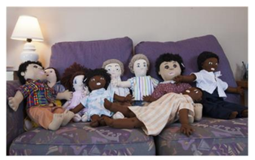
Dolls used for counseling kids who have been sexually assaulted.