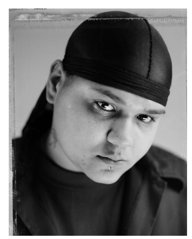
Chino, who was sexually abused by another inmate as a youth