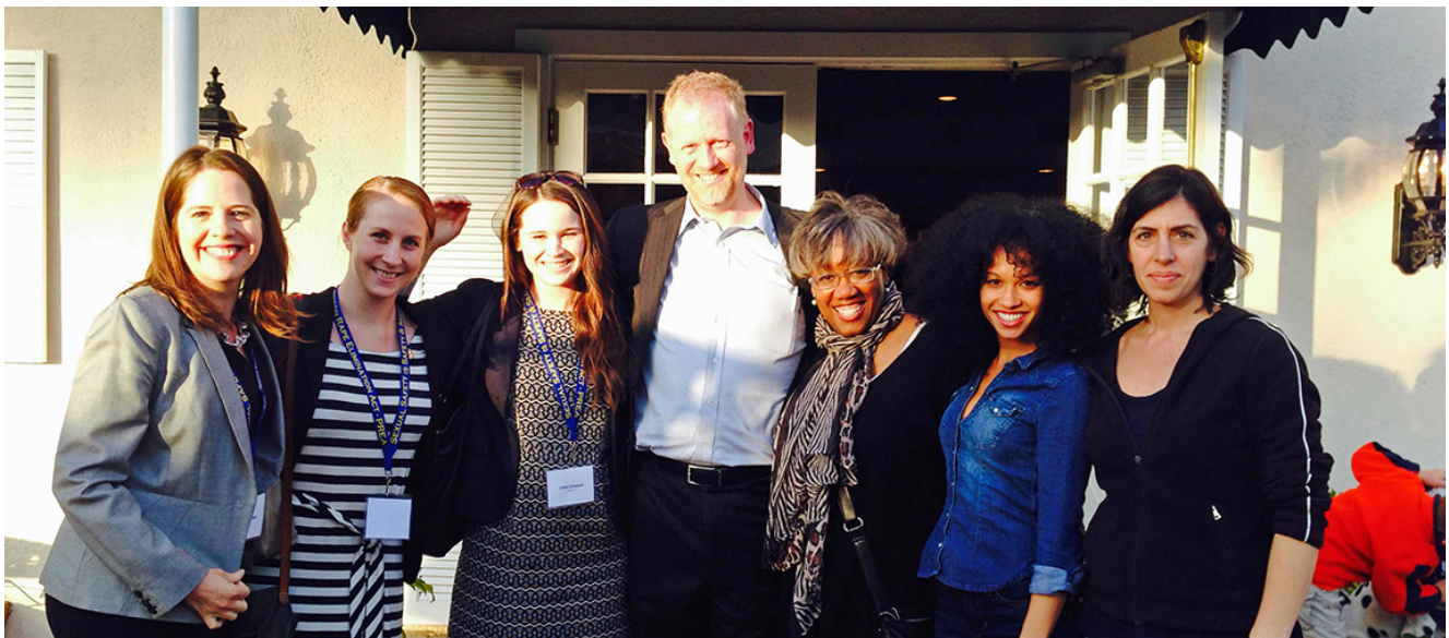
PREA Resource Center Staff – Auditor Training, San Diego, California

Funding to continue the work of PRC has been awarded to Impact Justice for two additional years, extending PRC until June 2018. A period of transition will commence in June 2016 from NCCD to Impact Justice. All involved parties are committed to making this as seamless a transition as possible, so as not to disrupt the provision of needed assistance and support to the field.