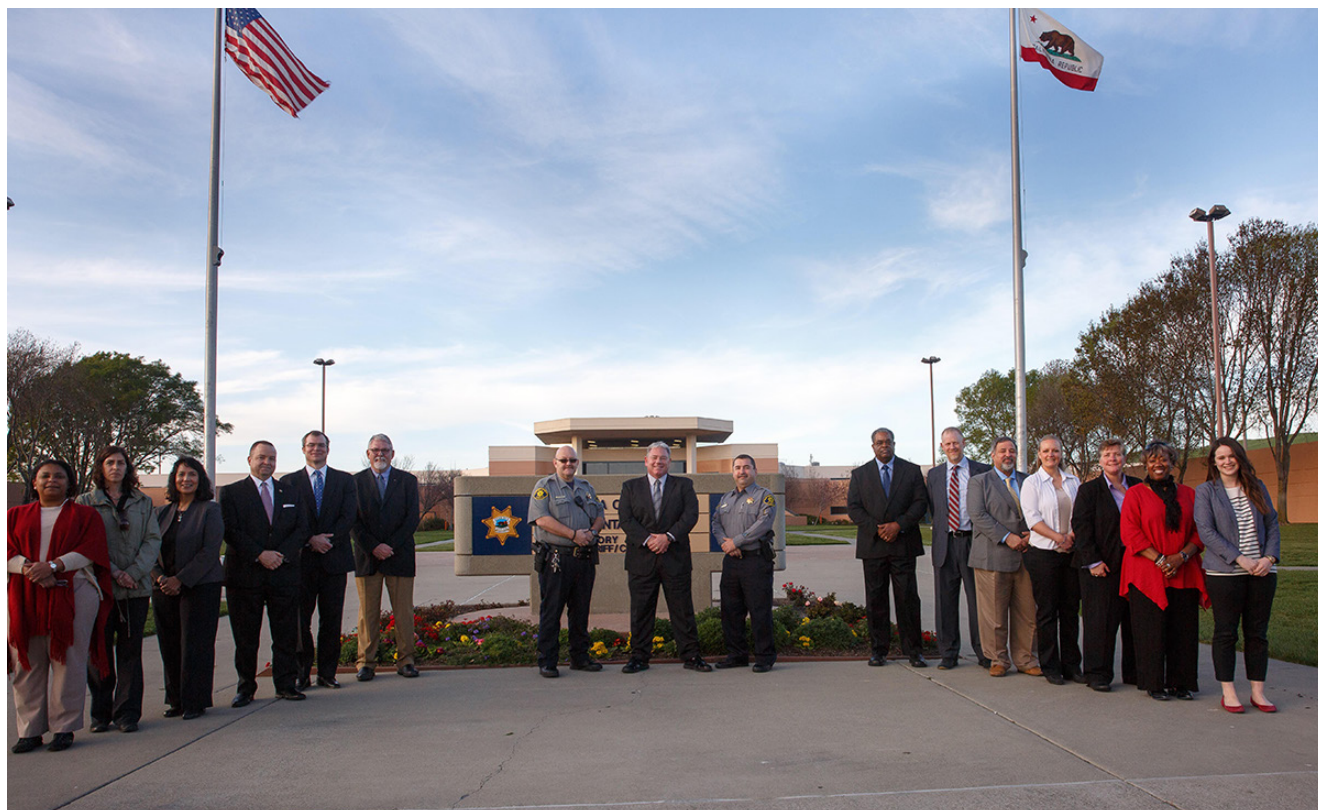
Field Training Audit Pilot at the Santa Rita Jail, Alameda Sheriff's Office, Dublin, California

The third and final year of the PREA audit cycle commenced August 20, 2015. PRC and PMO have spent significant time, effort, and resources supporting development of the audit function of the PREA standards. Major accomplishments related to the audit function include finalizing four audit instruments , hosting 11 auditor trainings for 865 potential auditors, processing 1,381 auditor applications , coordinating the certification and posting process for 600 certified auditors, providing ongoing auditor support, instituting the FTP for certified auditors, and developing a quality improvement process.