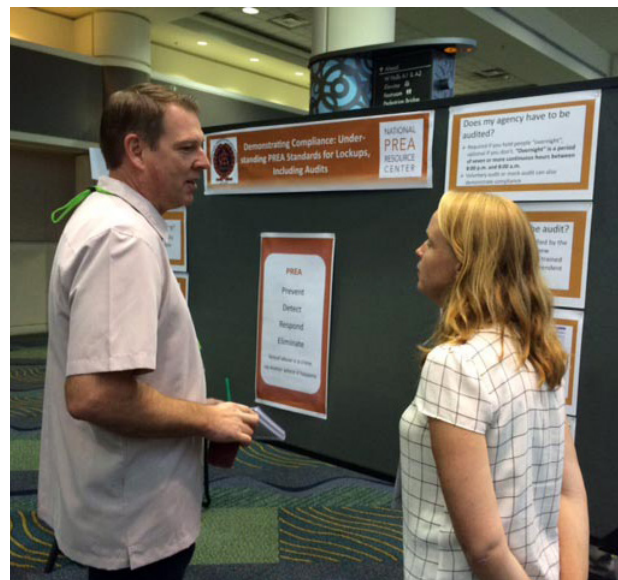
Poster presentation, International Association of Chiefs of Police Annual Conference, Orlando, Florida

In addition to delivering TTA to the field, PRC works with PMO to serve as a hub for resources and communications related to the PREA standards. The PRC library is a compilation of