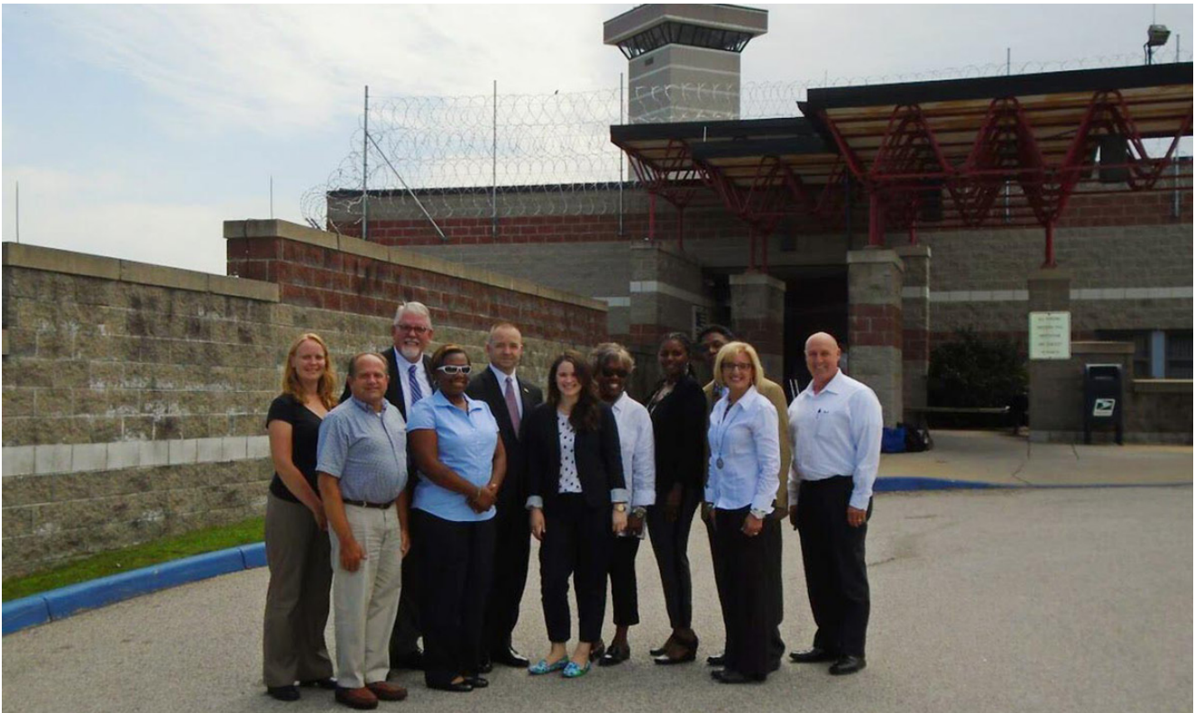
Field Training Audit, Mount Olive Correctional Complex, West Virginia Division of Corrections

instrument. Facilities complete the PAQ—including uploading documentation—which is then reviewed by the FTP audit teams in preparation for the onsite portion of the FTP. The online audit instrument allows audit documents to be completed electronically and reference materials to be uploaded and stored securely online, in lieu of the auditor keeping hard copies of all audit materials. Once live, the online instrument will also assist PRC and PMO in audit tracking, as discussed below.