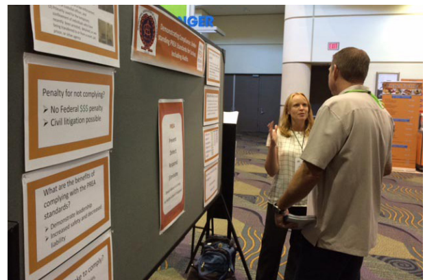
Poster presentation International Association of Chiefs of Police Annual Conference, Orlando, Florida