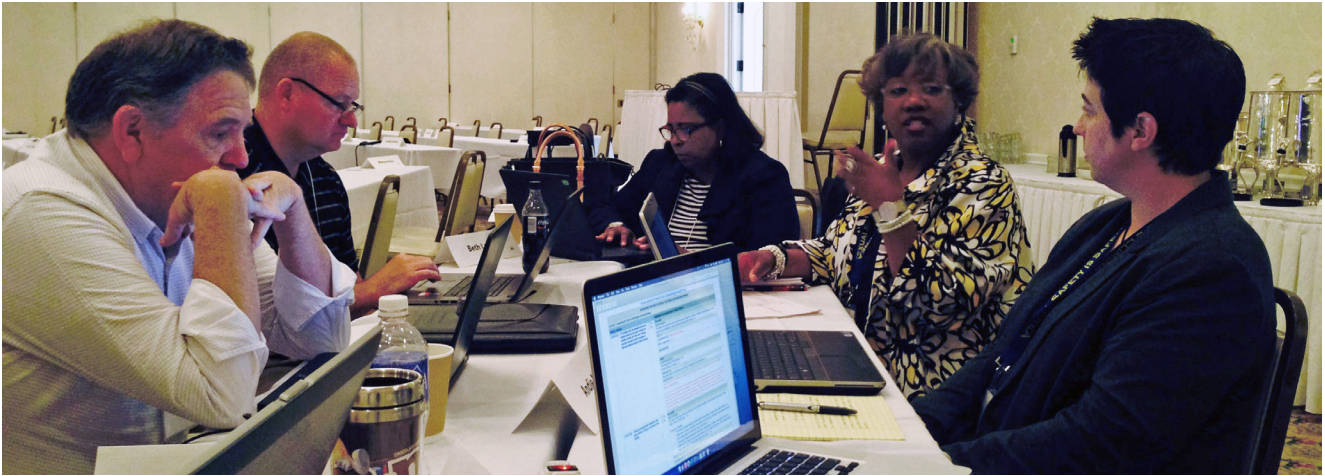
Auditor Training Small Groups - San Diego, California