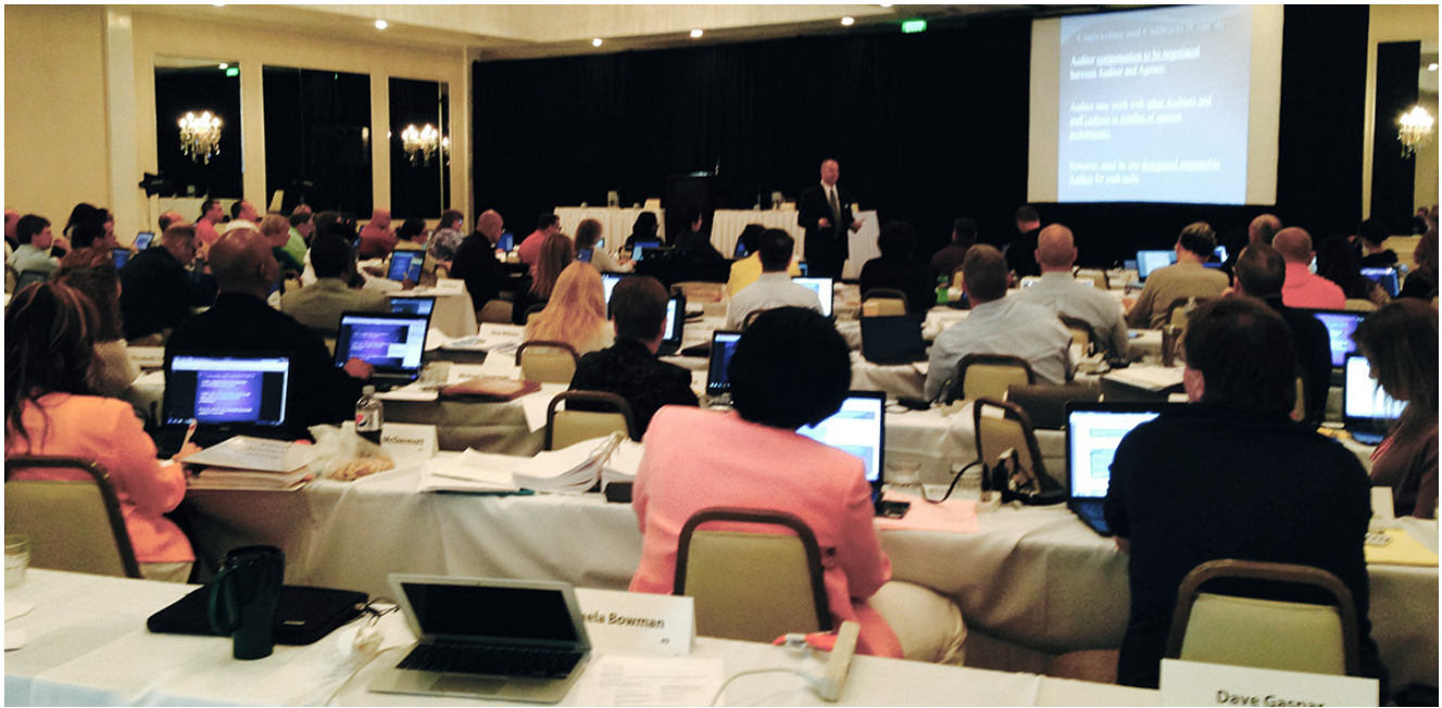
Auditor Training – San Diego, California

elements of the report, including evidence, reasoning, and the basis for all compliance determinations. Auditors then integrate PRC’s feedback into the report they submit to the audited facility. Typically, auditors will achieve full certification status after submitting two draft reports and successfully demonstrating improvement in their reporting practices. It should be noted that the probationary status in no way impedes an auditor’s ability to conduct audits and does not indicate lesser competence.