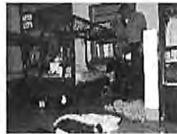
Inspector Reid and K-9 Chinook

The Special Investigations Unit provides investigative services to all ODOC institutions and facilities. The unit has investigators specializing in fugitive apprehension and prevention, drug and contraband investigations, investigations and employee misconduct. The unit is a resource to federal, state and local law enforcement agencies by providing them with intelligence and investigative assistance as it relates to inmates' criminal misconduct. Its work primarily comprises: