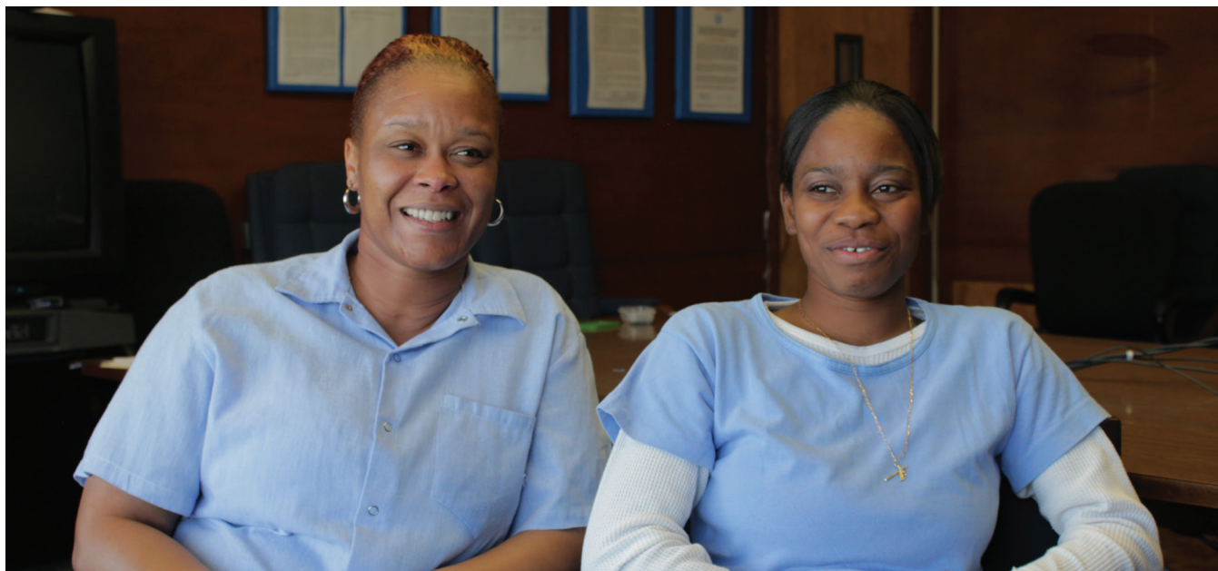
Peer education allows inmates themselves — like these two women at a California state prison — to become leaders in culture change.

Videos can be used to provide PREA inmate education. The National PREA Resource Center (PRC), in cooperation with JDI, has created a video and facilitator's guide that can be used for both intake and comprehensive education programs: www.prearesource-center.org/node/1912 . Facilities can use this video as the cornerstone of a comprehensive education program, supplementing it with their own written materials and in-person instruction. The video is also customizable, allowing facilities to shape it to meet their needs. Some facilities may choose to create their own video, using PRC's as a model. An example of a video for youth facilities can be found here: www.nmcoun-ties.org/insurance/loss-prevention-2/training-videos/prea-youth-education-video/